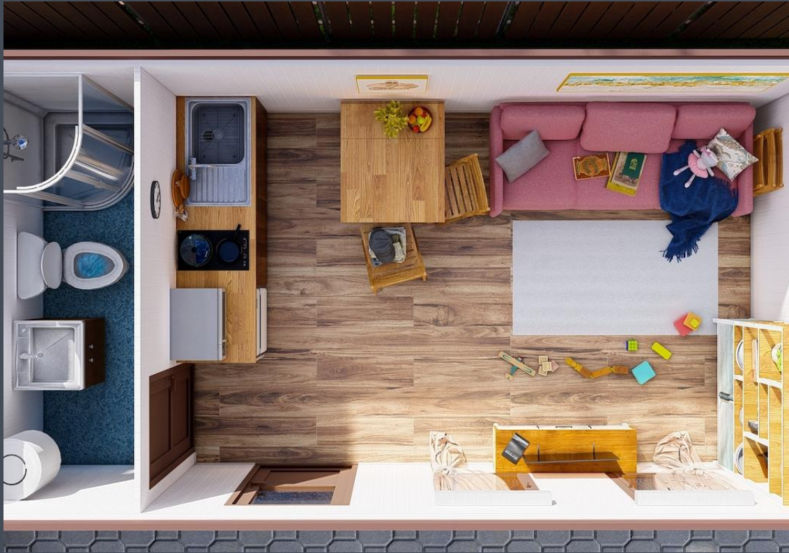
MODULAR HOUSES 1.2 (16.8 m 2 ) - £14,200