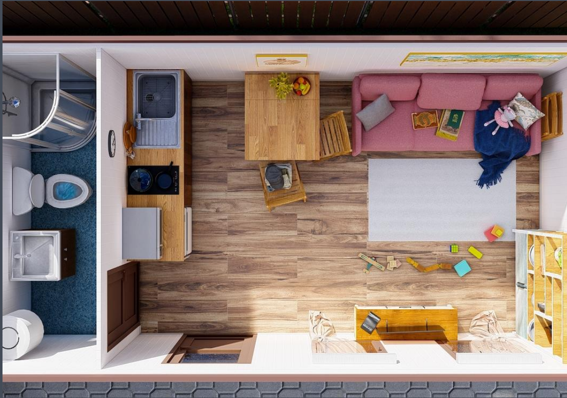
MODULAR HOUSES 1.1 (14.4 m 2 ) - £12,400